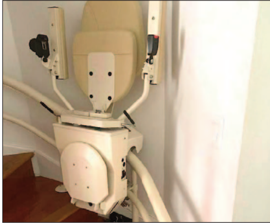
Suffern, NY - Stair lift, bathroom modification