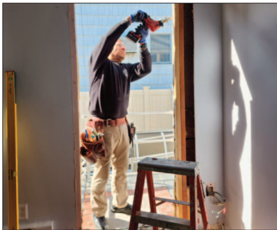
Gerritsen Beach, NY - Exterior doorway and bathroom modification