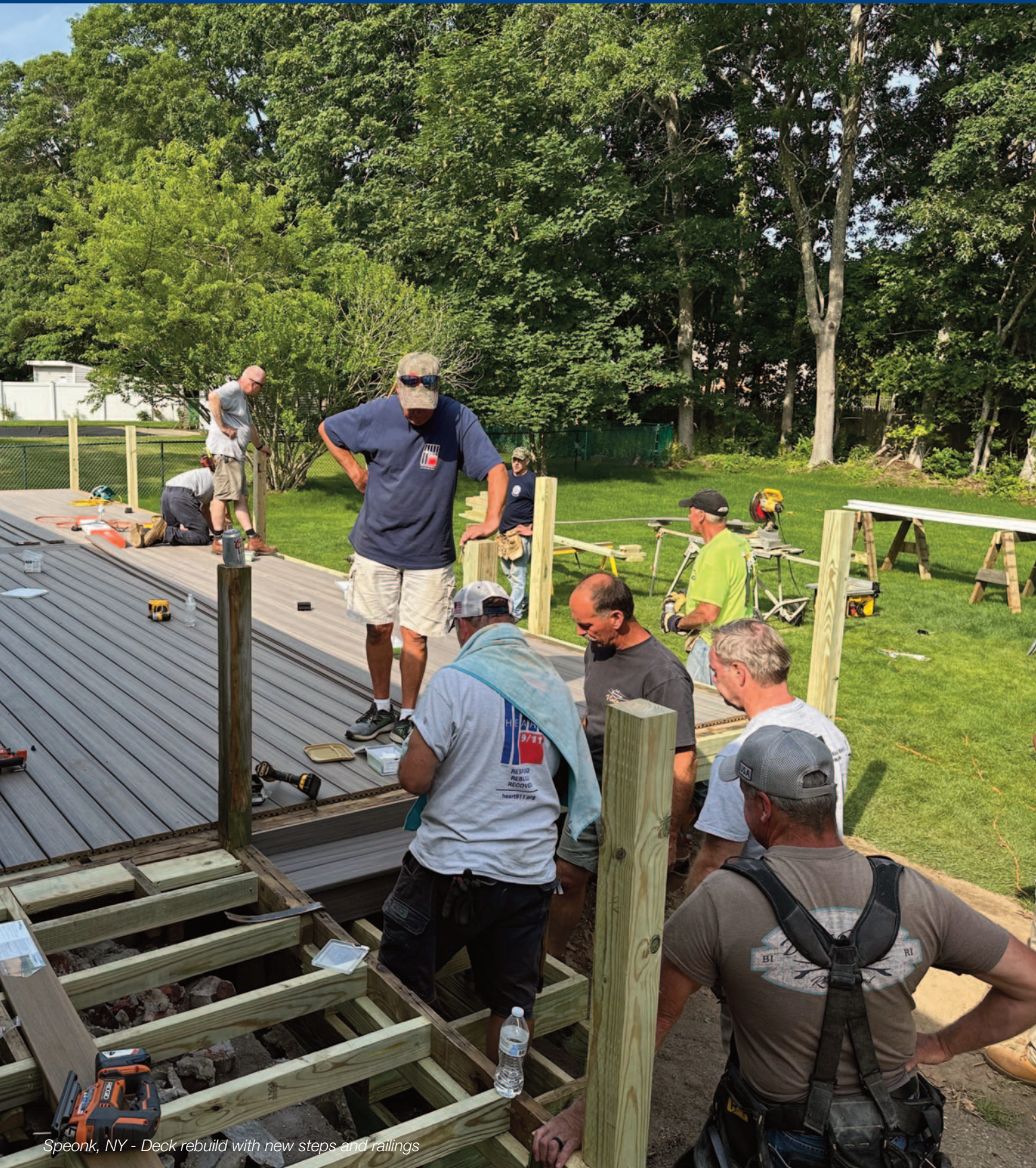
Speonk, NY - Deck rebuild with new steps and railings